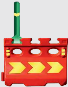
Jersey Barrier with Anti Glare Screen(S)