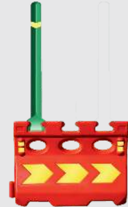
Jersey Barrier with Anti Glare Screen(L)