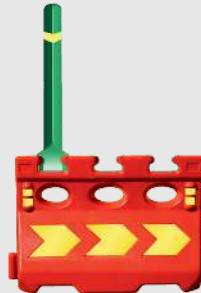
Jersey Barrier with Anti Glare Screen(M)