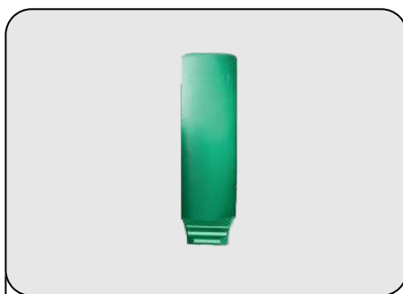
Anti Glare Screen(S)