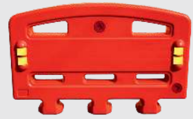
Jersey Barrier Extension