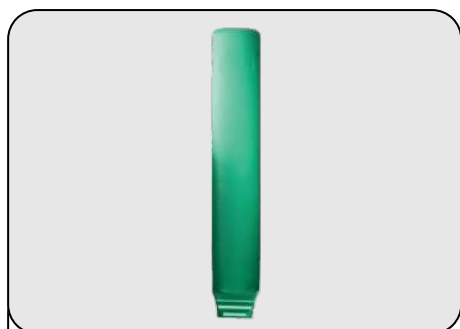
Anti Glare Screen(L)