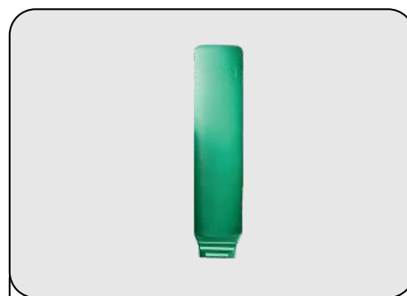
Anti Glare Screen(M)