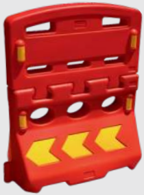
Jersey Barrier with Extension